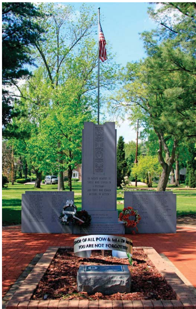
Vietnam Veterans Memorial – Beaver, Pa.