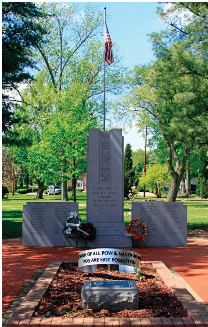
Vietnam Veterans Memorial – Beaver, Pa.