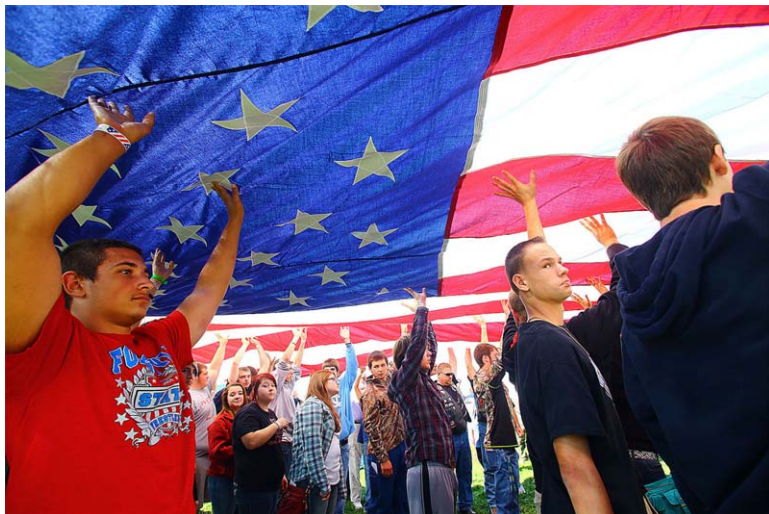
Flag Raising Ceremony—Kokomo Vietnam Veterans Reunion