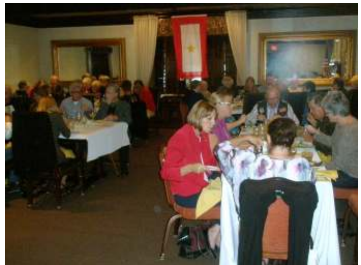
Gold Star Mothers Banquet—9/30/2015