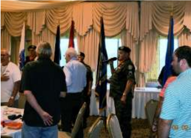
Veterans Breakfast Club—9/2/2015